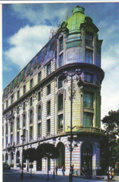
One Aldwych, in a landmark building near Covent Garden, boasts rooms (below) and a lobby (right) with a sleek, clean-lined chic.